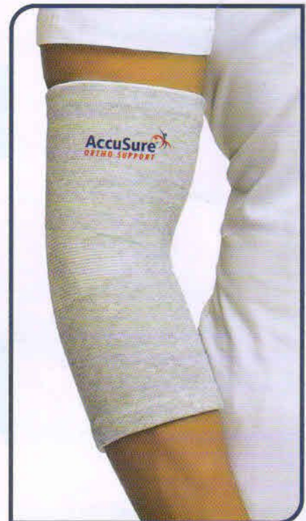
Bamboo Yarn Elbow Support Product Code: E12 Sizes Available: S,M,L,XL MRP: Rs. 325/-