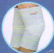
K12 KNEE SUPPORT