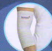
E12 ELBOW SUPPORT