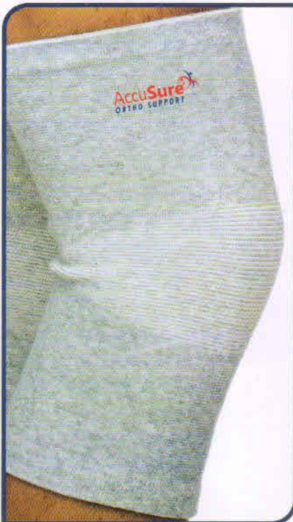
Bamboo Yarn Knee Support Product Code: K12 Sizes Available: S,M,L,XL MRP: Rs. 325/-

Presenting our range of Bamboo Yarn Products