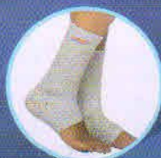
A12 ANKLE SUPPORT