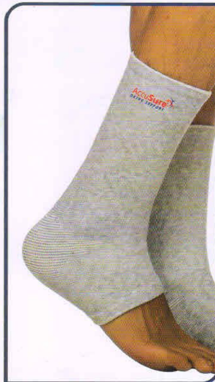
Bamboo Yarn Ankle Support Product Code: A12 Sizes Available: S,M,L,XL MRP: Rs. 325/-