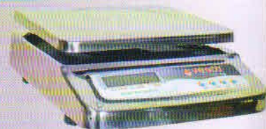
Table Top Scale (S.S. Body With Pole)