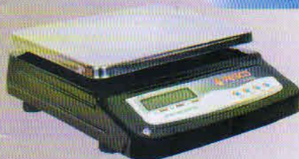
Table Top Scale (S.S. Body)