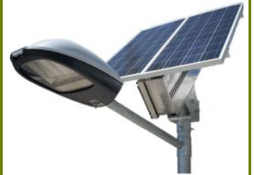
Solar Street Light