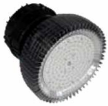
High Bay Light