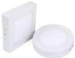
Surface Down Light