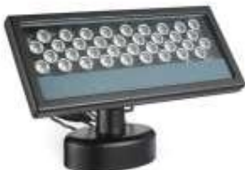
Wall Underwater Light