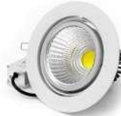
COB Down Light